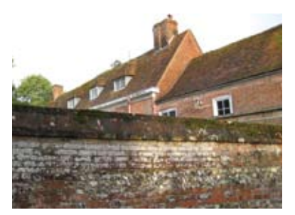
A variety of materials and styles is visible: capped cob and brick walls, hedges and wooden fences. Leylandii hedging and close board fencing are